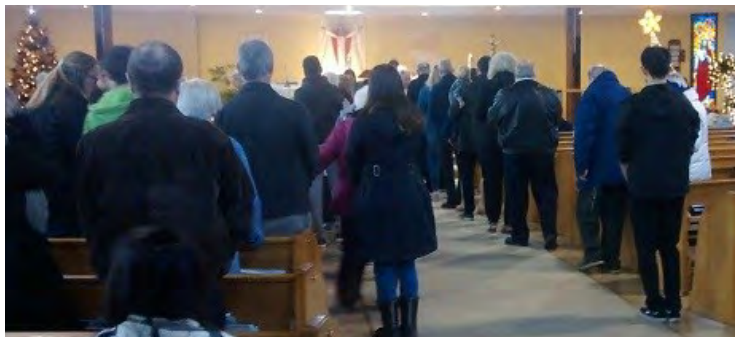
New Year Mass Pre-COVID-19 : January 2020