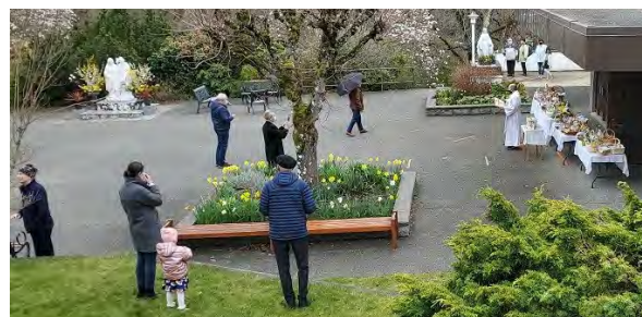
Polish Blessing of Food on Holy Saturday 3 April 2021