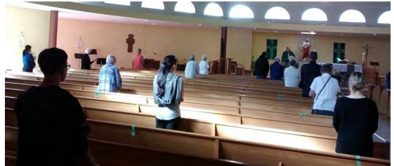
Mass Attendance during COVID-19 : July 2020