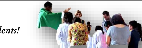
Teachers & students' blessing, Sat. 31 Aug 2024

Have a most fruitful and productive school year ahead!